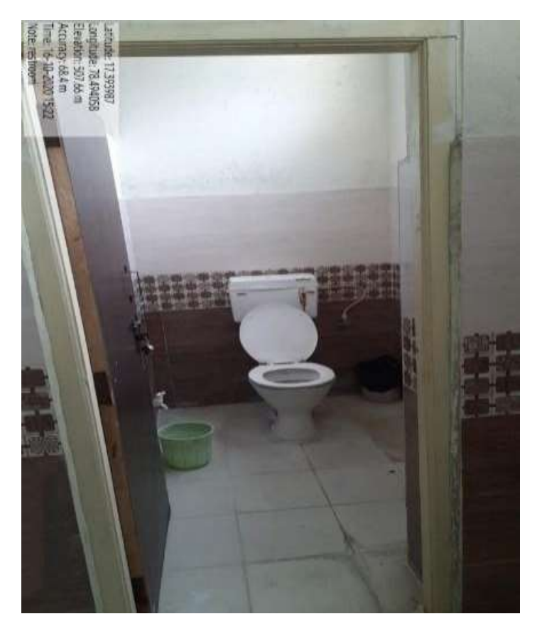
Disabled Friendly Washrooms