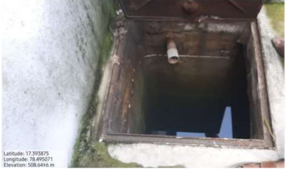
Borewell /Open well recharge