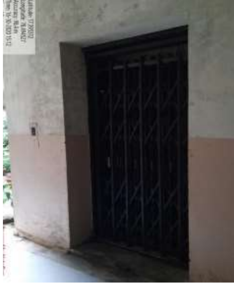
Lift for easy access to classroom