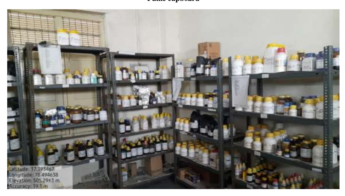
Proper Storage of Chemicals