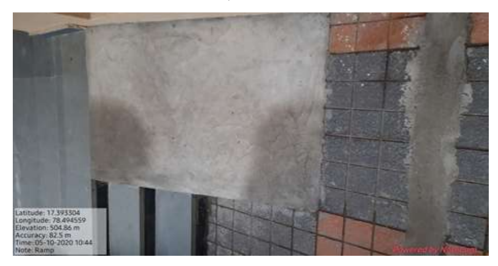
Disabled Friendly ramp