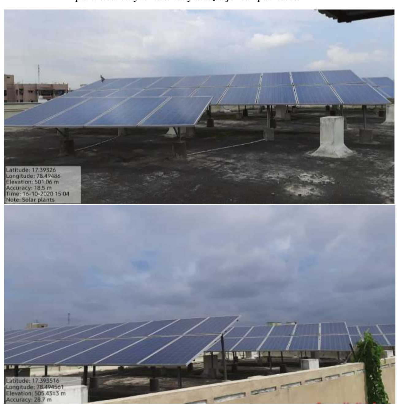
Solar Energy Panel

Solar power plant: At the roof of campus a solar power plant has developed. Solar power plant electricity is maximally utilized for campus needs.