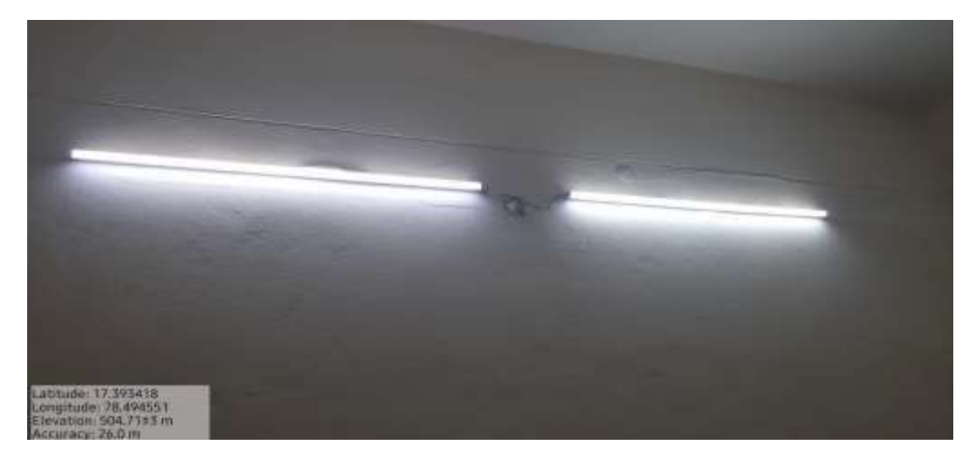
LED BULBS: Energy conservation measures