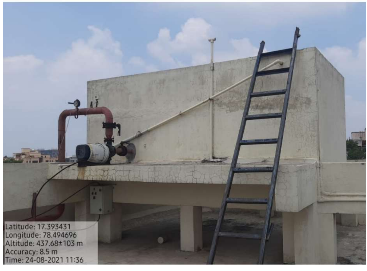
Construction of tanks and bunds