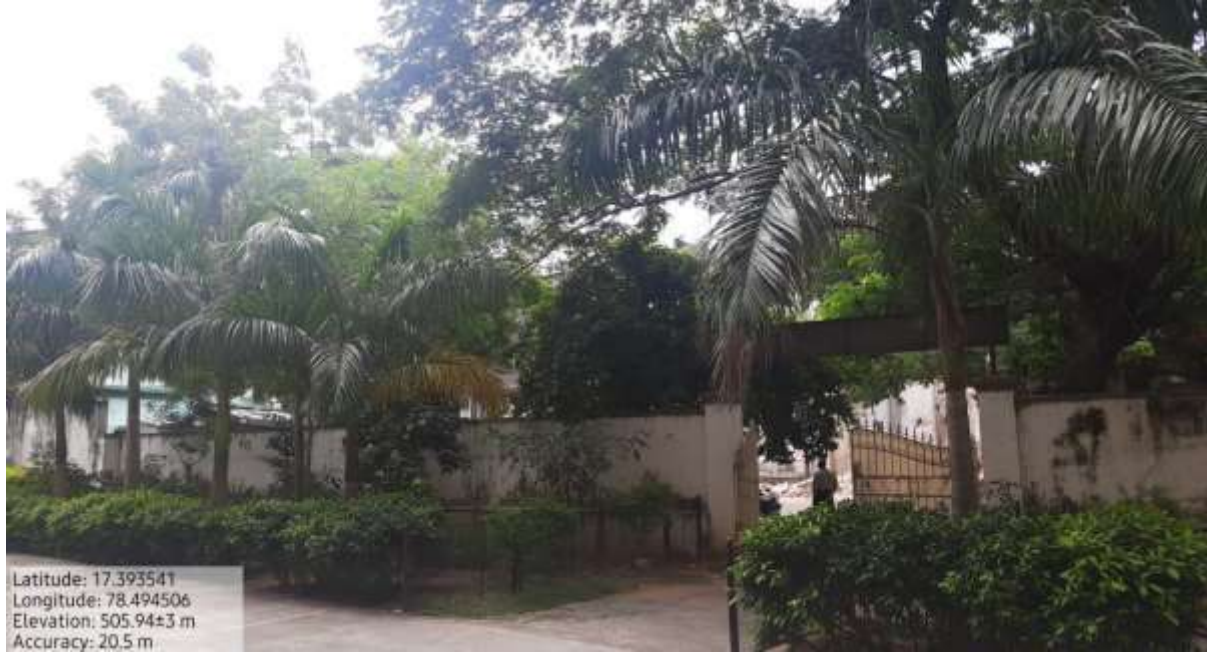
Landscaping trees and plants