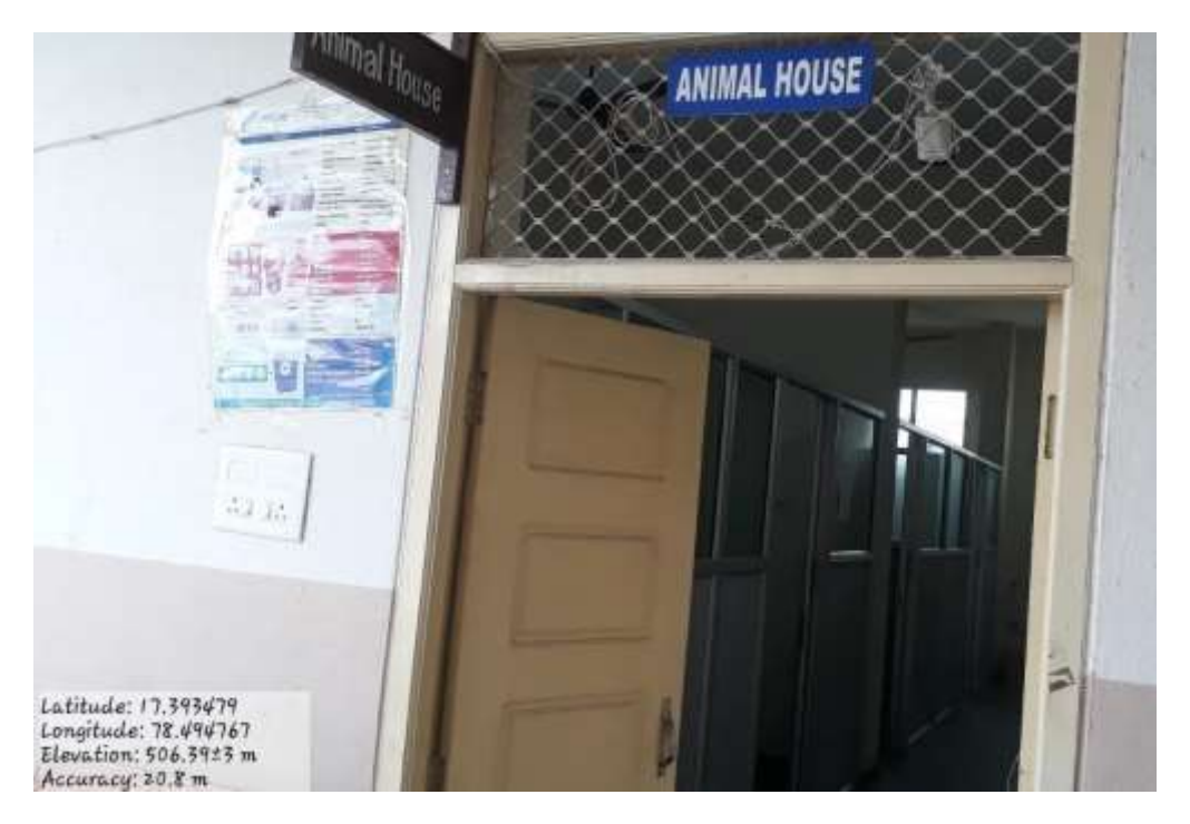
Animal house is one of the sources of biomedical waste