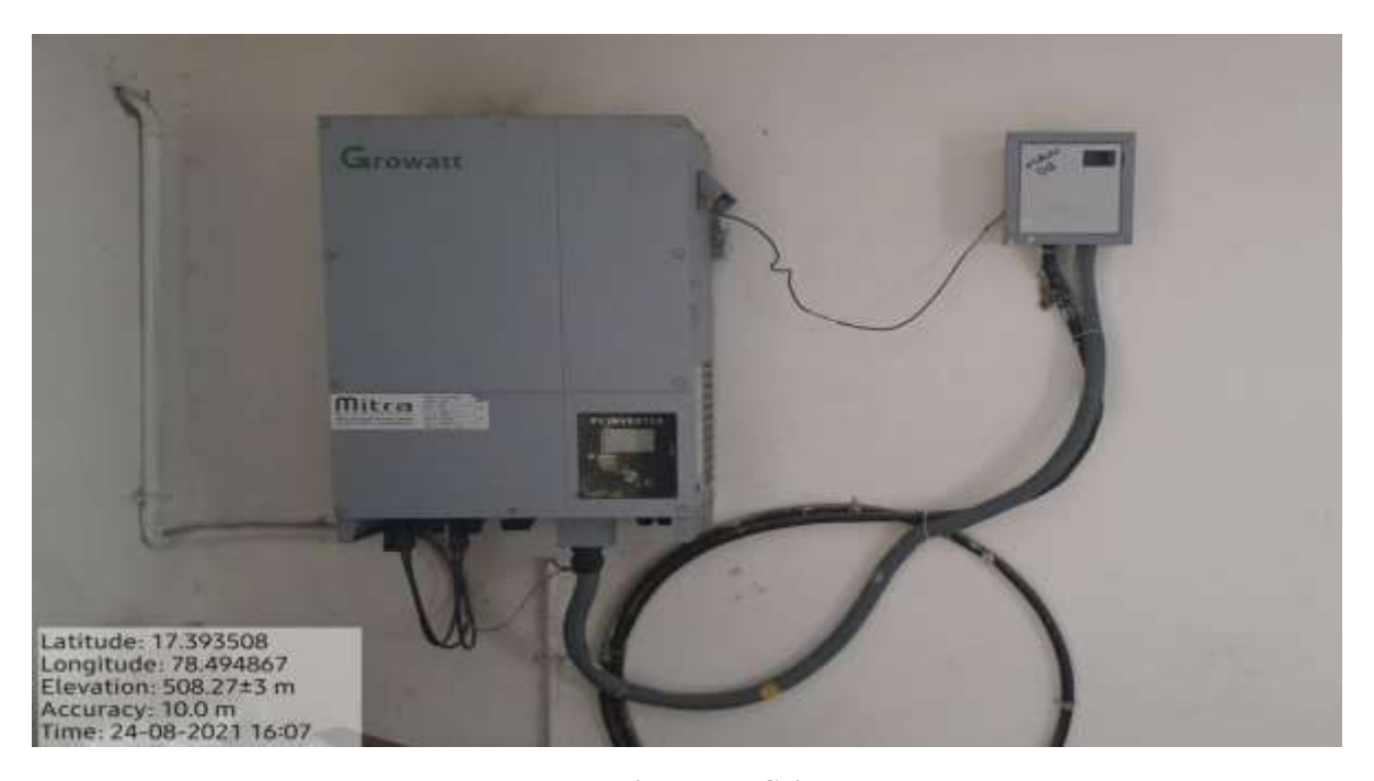
Wheeling to the Grid