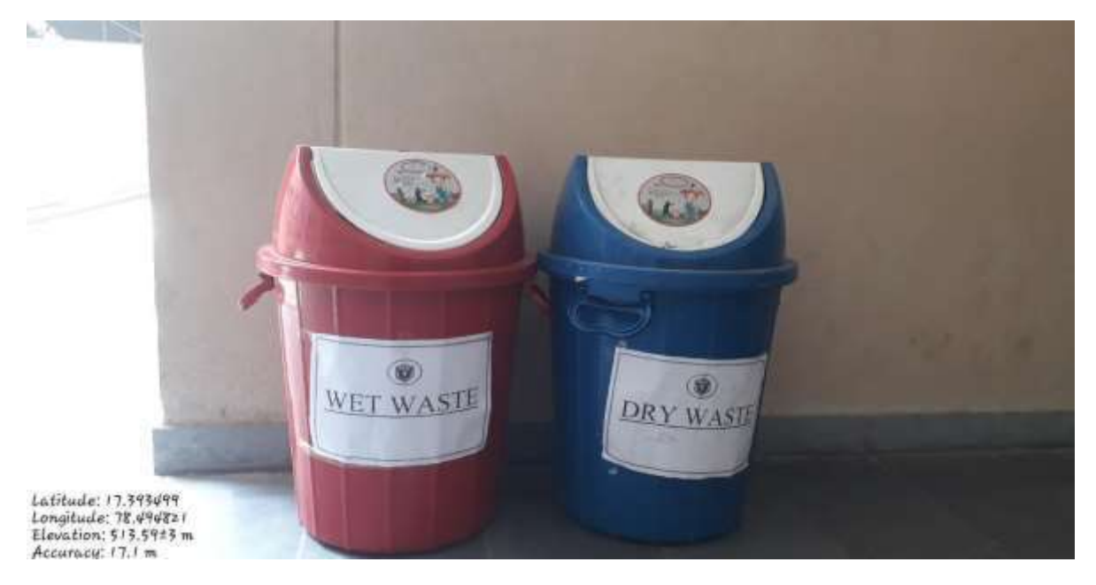
Color coded garbage bins